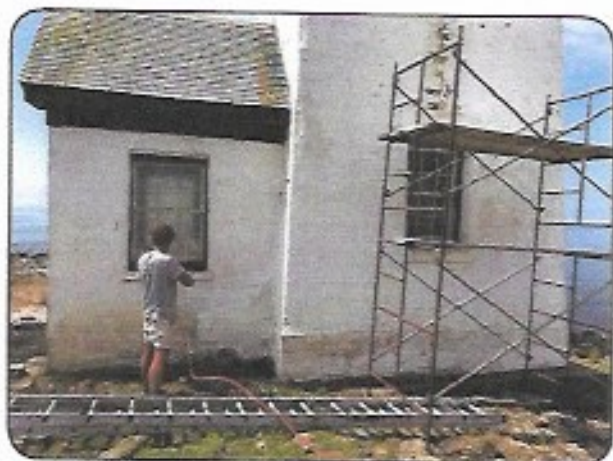
Gray Miles pressure washing tower